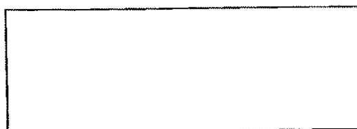
Figure 1 Figure caption

If figures are inserted into the main text, type figure captions below the figure. In addition, submit each figure individually as a separate file. Figures should be provided in a file format and resolution suitable for reproduction, e.g., EPS, JPEG or TIFF formats, without retouching. Photographs, charts and diagrams should be referred to as "Figure(s)" and should be numbered consecutively in the order to which they are referred